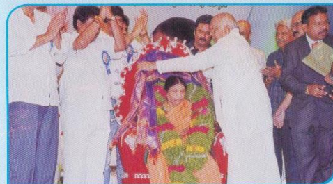
Felicitating of my Mother by "PADMAVIBHUSHAN" Dr. AKKINENI NAGESHWAR RAO garu on the occasion of Mother's Day on 13th May, 2011.